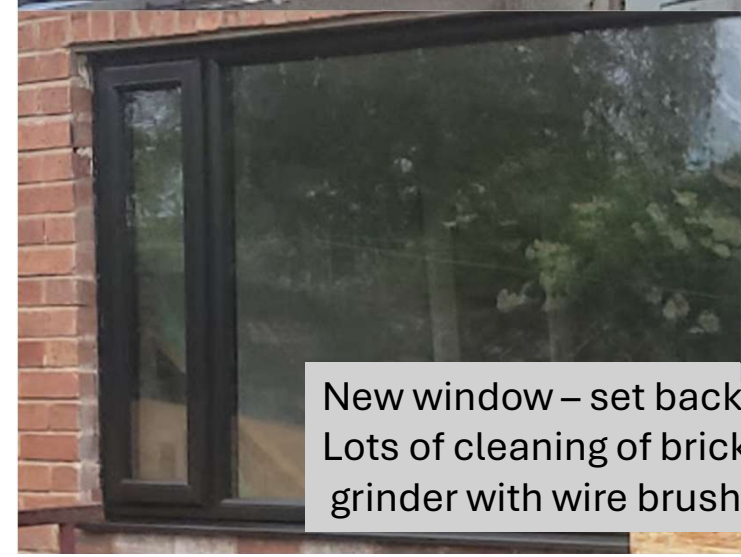
New window – set back Lots of cleaning of bricks – we had to add lintel grinder with wire brush and flap sanding disks