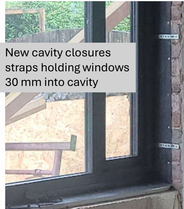
New cavity closures straps holding windows 30 mm into cavity