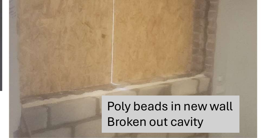
Poly beads in new wall Broken out cavity