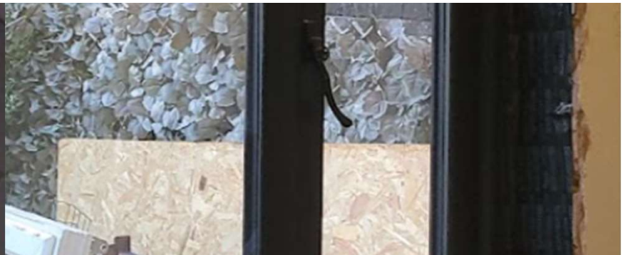
Air tight tape to window and from closer to brick Cill will have worktop to window. We will install some more insulation to it then